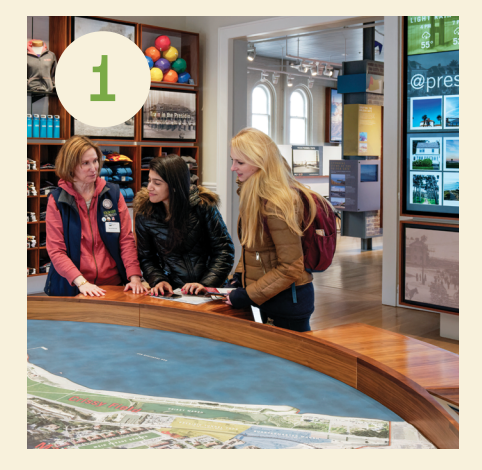
PRESIDIO VISITOR CENTER Plan a great day in the park with the help of a ranger. Enjoy videos, exhibits, and a changing collection of park clothing, books, and mementos.